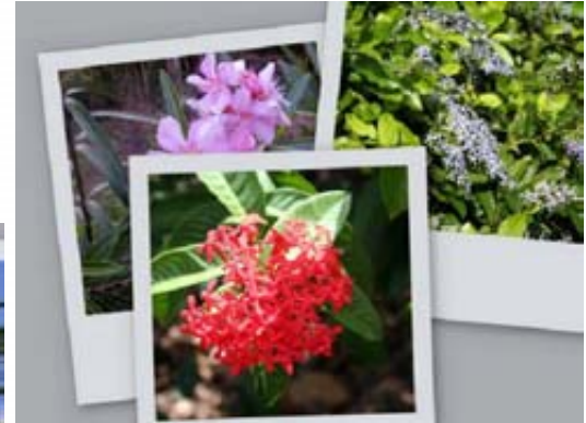
Ixora and Purple Star