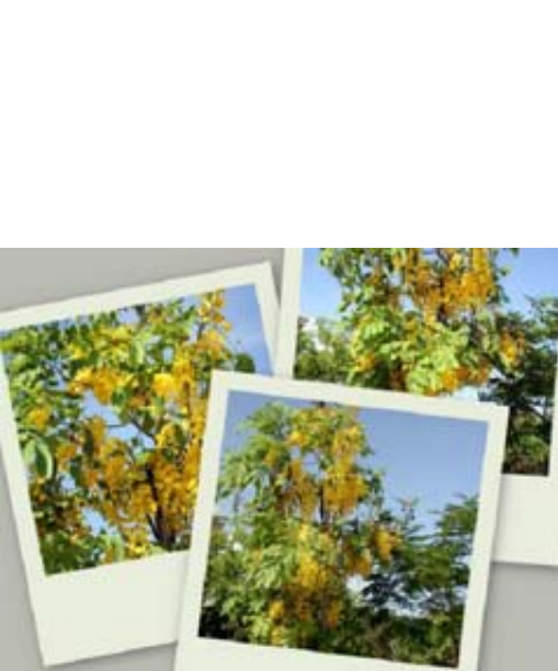
Shower of Gold (Cassia Fistula)

After three very dry months where every tree dropped their leaves, we had a rainy month of May. Everything bloomed at the same time. The beauty of this display of color was only exceeded by the rich fragrance given off by all of these flowers.