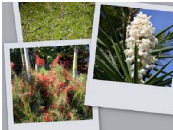
Firecracker and Yucca Plant